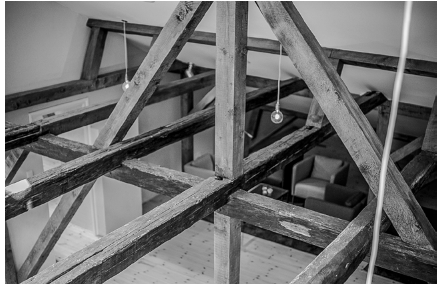
Fusion - Gál Tibor Winery Eger, 2011