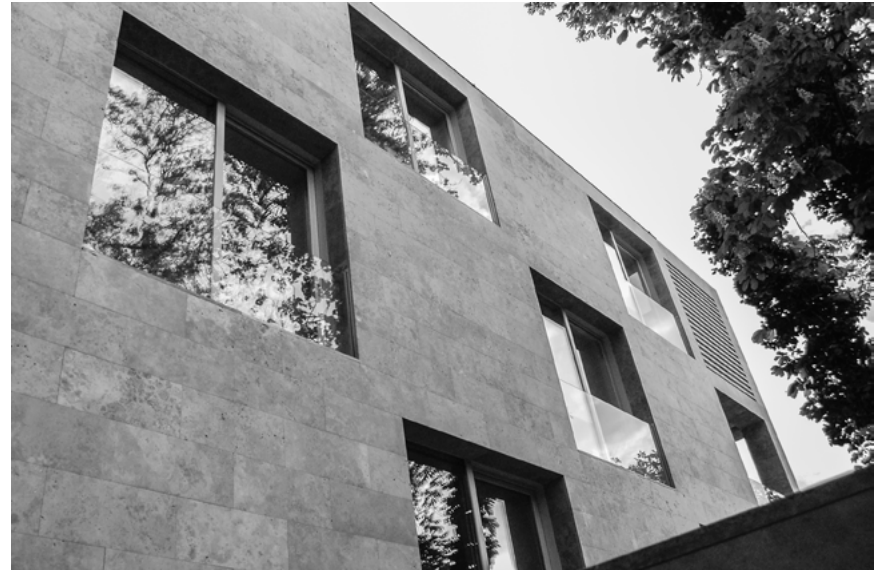
Four-family condominium Budapest, 2009