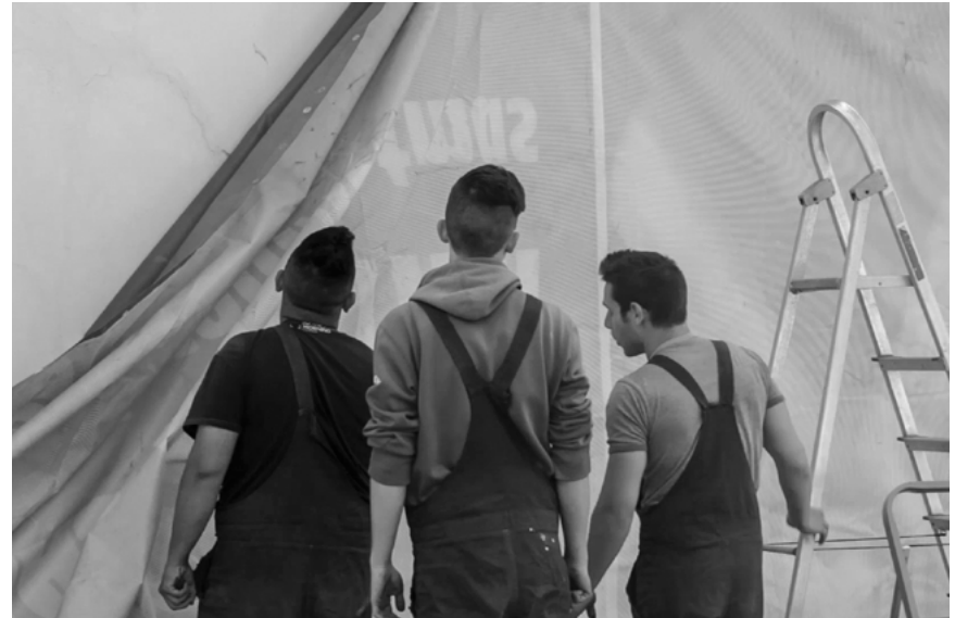
Arkt Arts Centre (Ellátó) Eger, 2013–2015