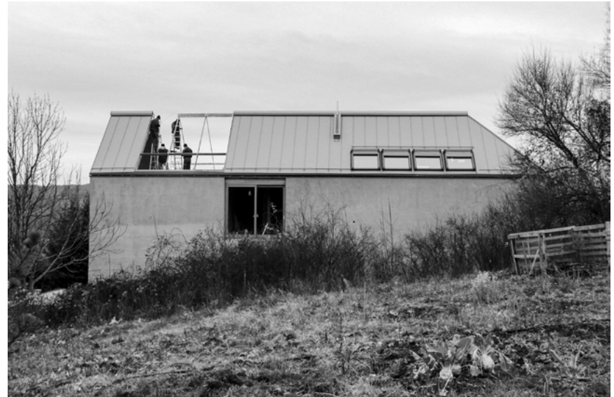
Single-family residence Felsőtárkány, 2011