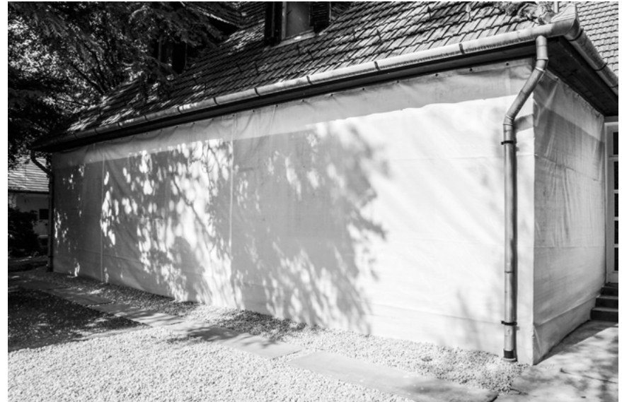
Arkt Arts Centre (Ellátó) Eger, 2013–2015