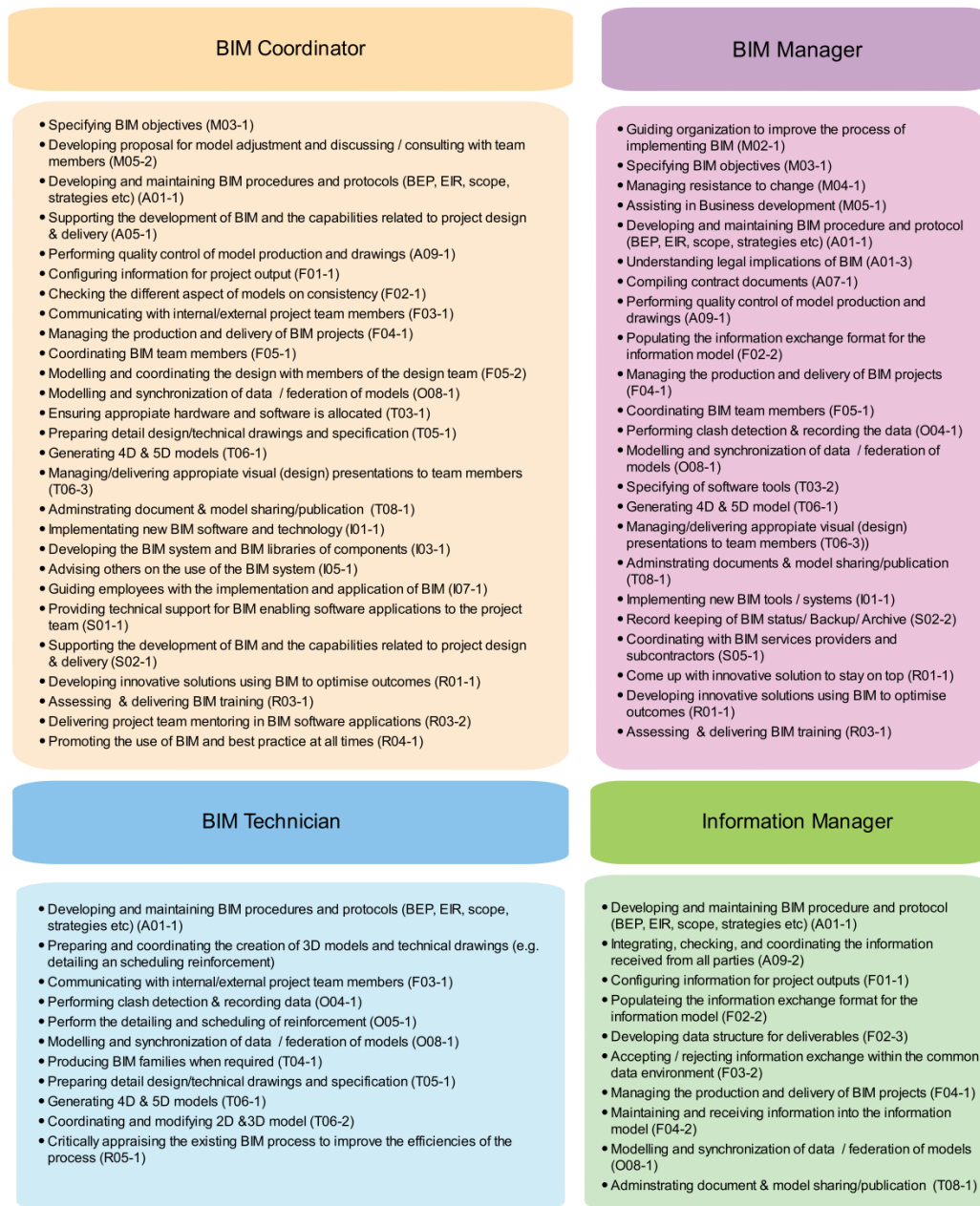
Fig. 2. A role profile summary for the BIM four specialist roles

disparate policy documents (guides, standards, and protocols) that could be either organization or project focused. Indeed, the literature provide evidence that policy documents include organizational BIM roles and activities in project-level guides and standards and urge for a division between the two reduce ambiguity and uncertainty [9]. Exempt from this issue is the Information Manager whose role description is mostly project-oriented.